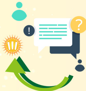
Question / Answer platform (*1) (will be released)