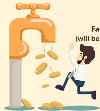
Faucet (will be released)

*1: It is possible to exchange knowledge and wisdom on the Question Answer platform, and you can use SanDeGo coins in exchange for other advice and wisdom. Specifically, for respondents who have given more appropriate answers to the questions of the questioner, the questioner can send SanDeGo coins to the respondents as a way to thank them. In addition, information accumulated on this platform can be freely viewed by everyone.